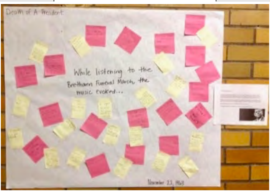
Example of student work from this project.