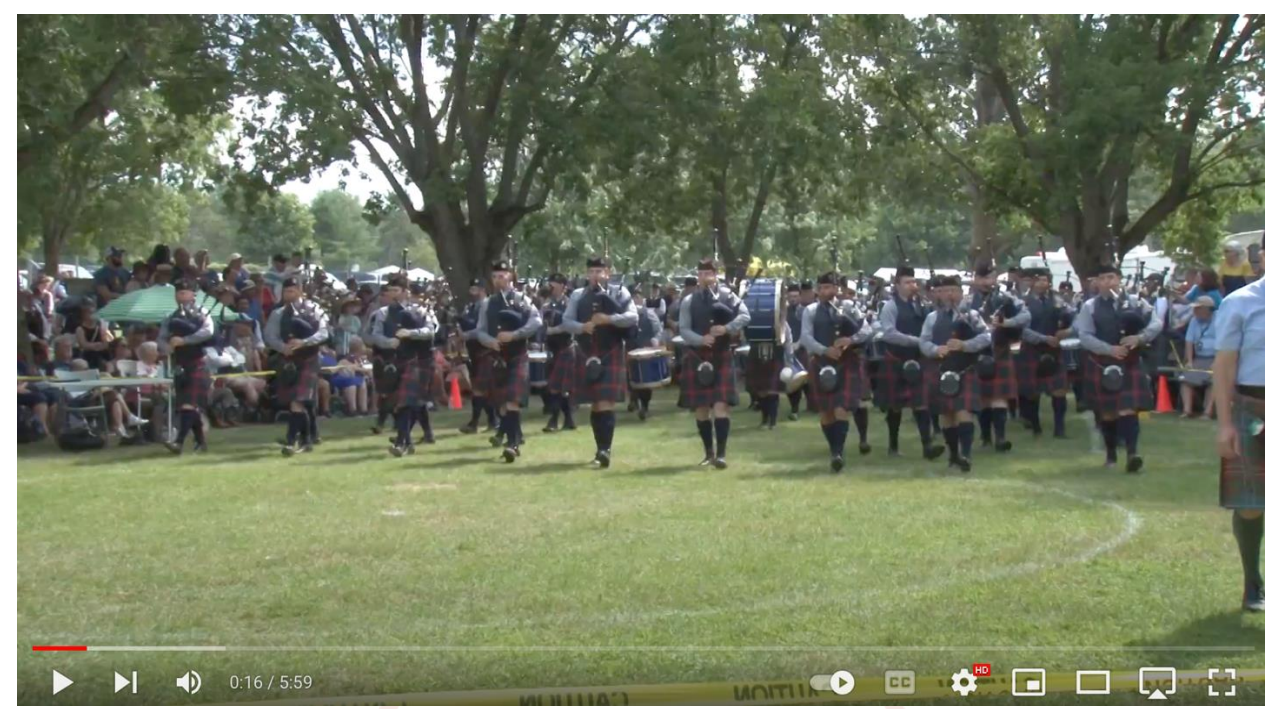
The 78<sup>th</sup> Fraser Highlanders competing at the North American Pipe and Drum Championships, August 2019 (<a href="https://www.youtube.com/watch?v=5MuEZHPk0lQ&t=137s">https://www.youtube.com/watch?v=5MuEZHPk0lQ&t=137s</a>, retrieved July 5, 2022)

The second observation was a two-day rehearsal in Burlington, Ontario and performance in Hamilton, Ontario. With no time to interview participants during the packed weekend rehearsal, the researchers arranged to interview participants via Zoom in February 2020. Ten members of the 78ths volunteered to participate—nine men and one woman, ages 20-65. Following Salmon's (2014) online interviewing protocols, interviews were approximately one hour to 90 minutes; after data were transcribed and analyzed, participants were interviewed again in July 2020. Secondary interviews were 30-45 minutes in length. One participant was interviewed a third time in March 2021. All interviewed participants were of legal age and requested that we use their real names, not pseudonyms.